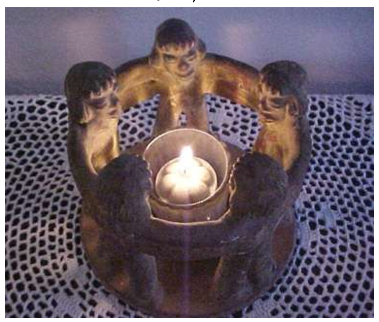
The Group Work

If you can't think of a jingle to say, a group OMMMM or AUUUMMM can be very powerful with a single intent. Start by holding hands, raising them slowly as the energies increase, release when hands reach all the way up.